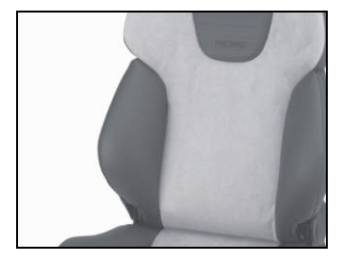
Adjustable side bolsters