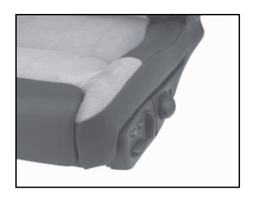
Combined electric height and tilt adjustment (Topline only)