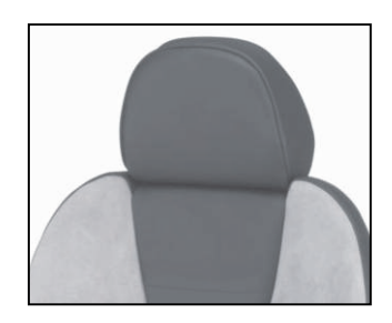
Fully upholstered headrest