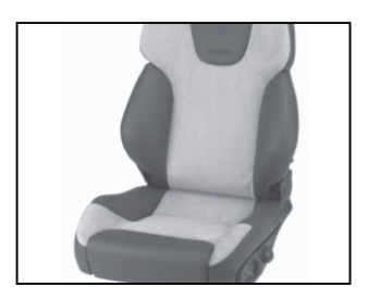
The unique RECARO climate package (Topline only)