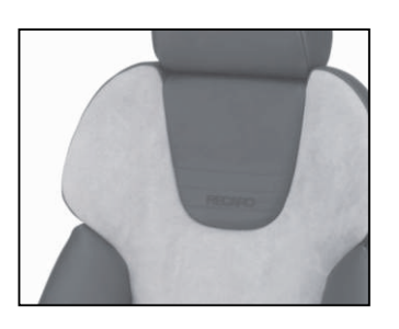
Contoured shoulder area